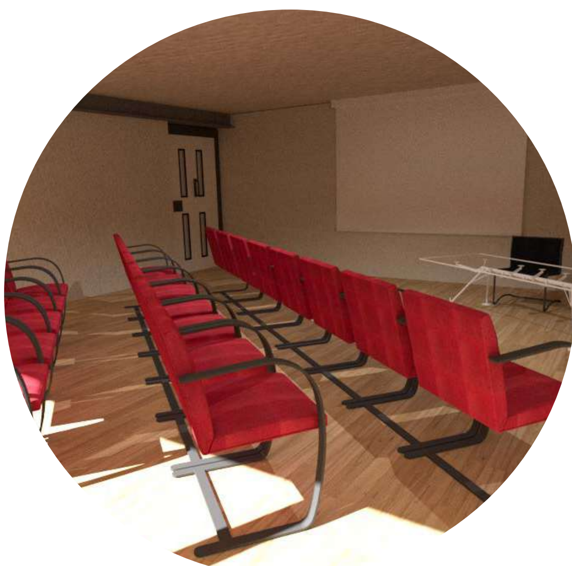
View of the Auditorium