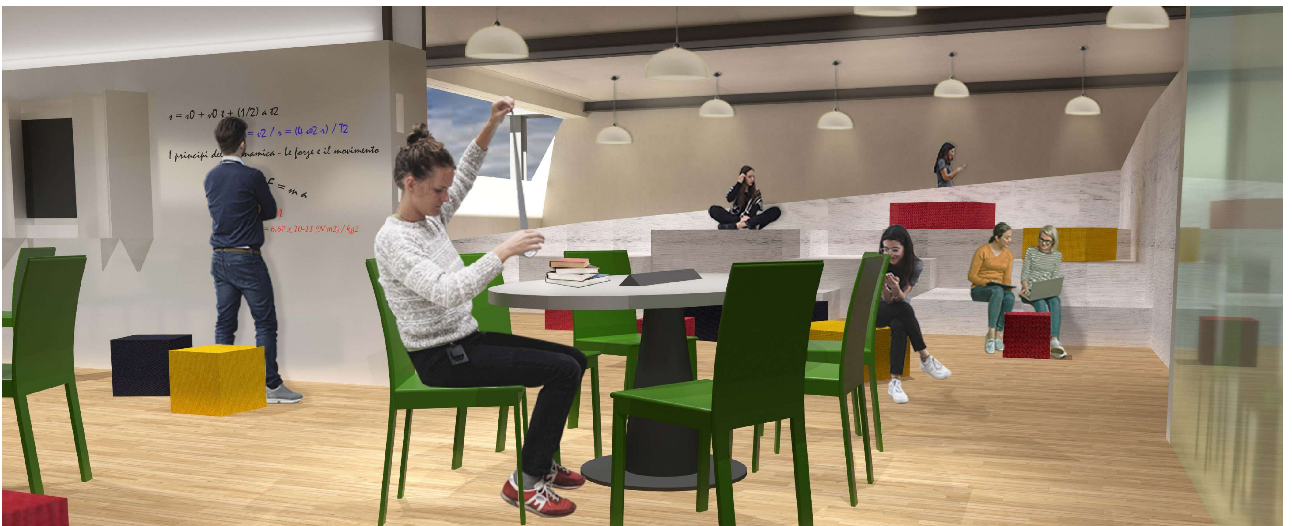
View of Studying Pods and Steps